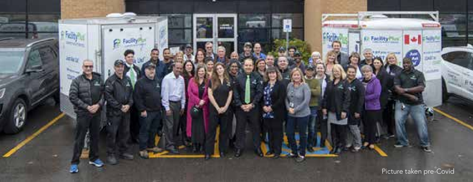
Picture taken pre-Covid